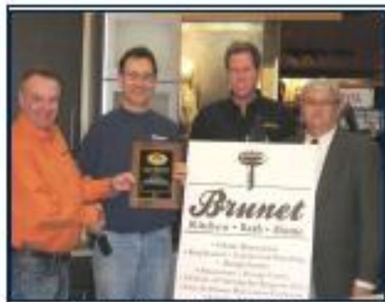
Most Creative & Informative Display Best Booth Award Winner

Brunet Plumbing Kitchen and Bath Supplies